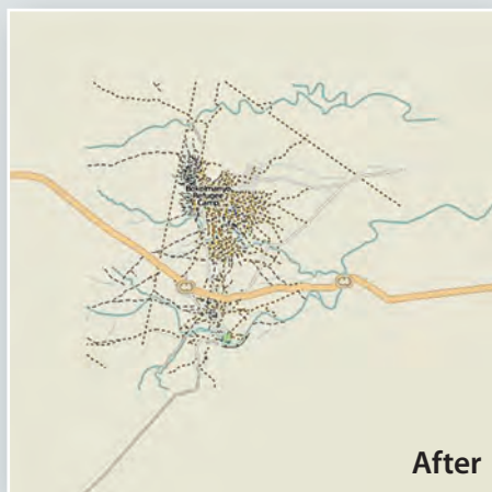
Bokolmanyo refugee camp in the OSM database (28 May 2012)